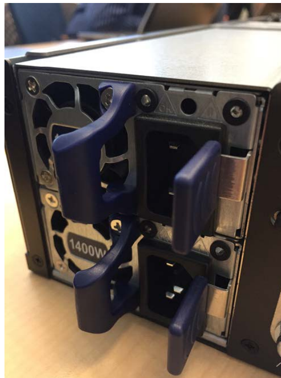
FIGURE 1 AC PSU